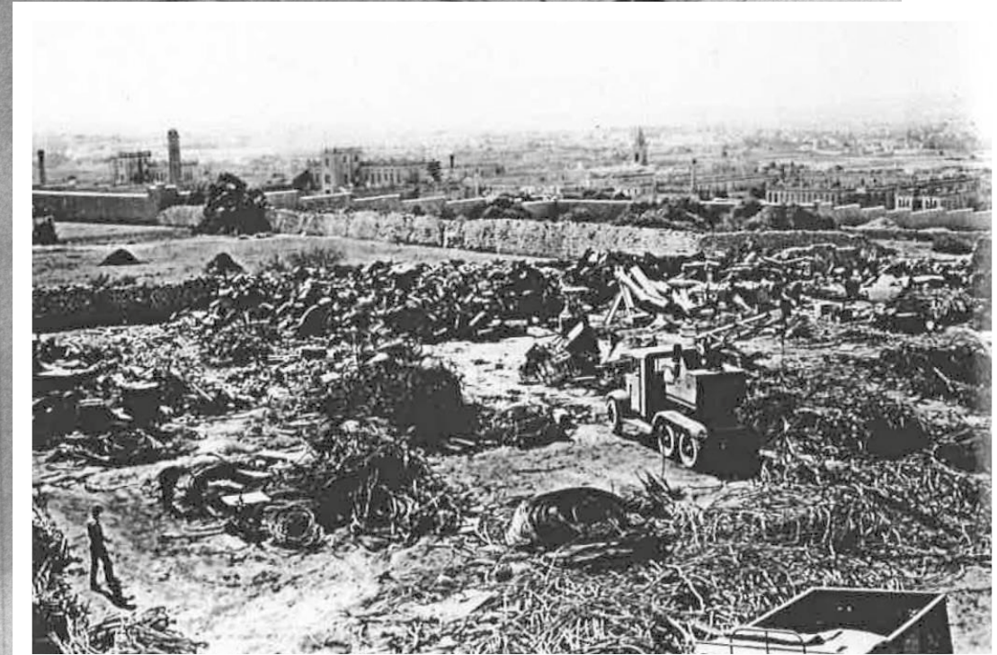
The yard circa 1955

From then onwards, DDE Attard Ltd forged multiple reputable relations with major stakeholders, which aided in building a portfolio of clients to be truly proud of. The company, which now boasts the largest private waste management facility on the island, achieved numerous waste management permits over the years, all of which led to it earning the IPPC Permit for Waste Treatment Management.